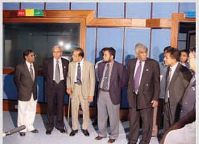
At the inauguration of the Digital Studio of the Advance Digital Multi Media Centre of the UCSC established with JICA assistance. [2003]