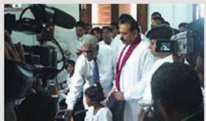
At the inauguration of the Nenasala at Sri Dalada Maligawa on 1st January 2006 by H.E. the President, Mahinda Rajapaksa. [2006]