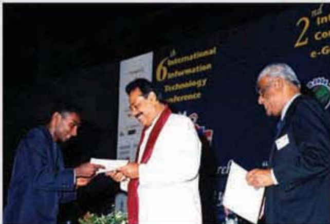
Hon Mahinda Rajapaksa Prime Minister as Chief Guest at the Joint IITC2004 and ICEG2004 awarding certificates of recognition to the IOI team that did extremely well by winning 1 Gold and 3 Bronze medals. [2004]