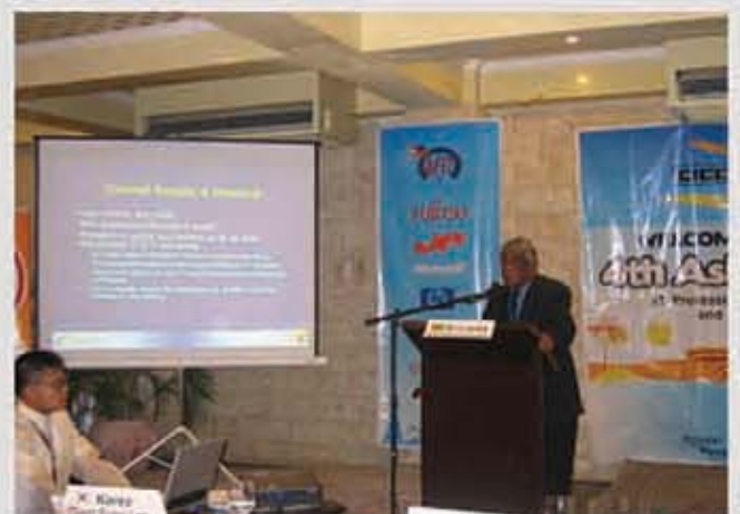
Addressing the Asian Forum for IT AFIT in Chiba, Japan [2006]