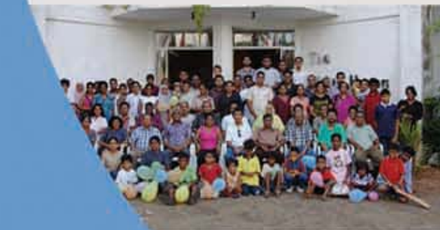
At the farewell party organized by the Welfare Society of the UCSC in May 2004 at White Haven Resort, Wadduwa.