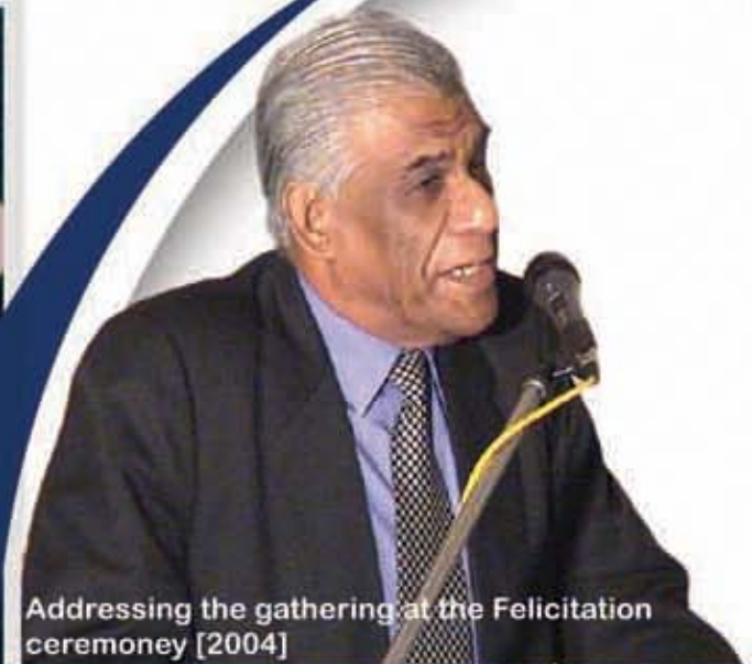
Addressing the gathering at the Felicitation ceremony [2004]