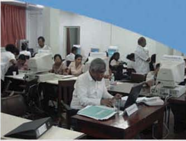
With the UCSC team processing and releasing the results of the 2004 Parliamentary General Election. [2004]