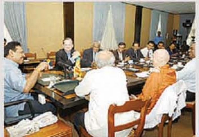
Prof. Lessig meeting H.E. the President Mahinda Rajapaksa. With back to camera is Hon Tissa Vitharana, Minister of Science & Technology [2006]