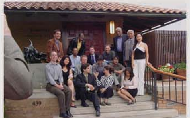
With Digital Vision Fellows at Stanford University. [2005]