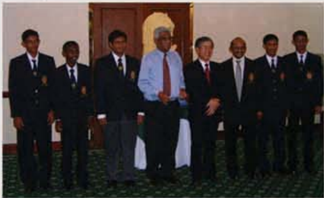
With the Sri Lankan Team to the International Olympiad in Informatics IOI in 2004 together with Manager and Deputy Manager. CEO of Sri Lanka Telecom that sponsored the team is also in the picture [2004]