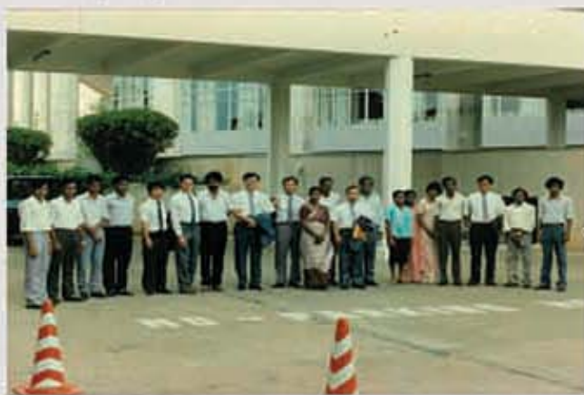
The staff of the Institute of Computer Technology together with eight Japanese experts began work at the BMICH in September 1987 as the new building complex for the ICT at the University of Colombo was not ready. [1987]