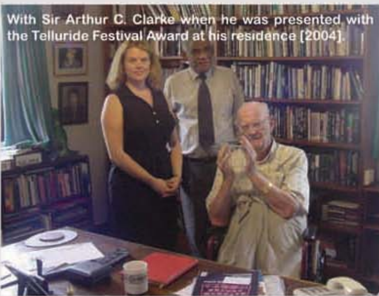
With Sir Arthur C. Clarke when he was presented with the Telluride Festival Award at his residence [2004].